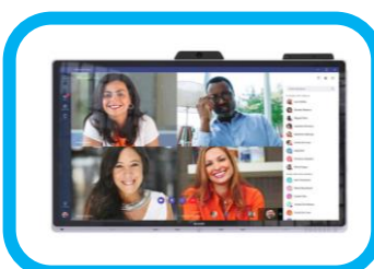
WCD – Windows Collaboration Display